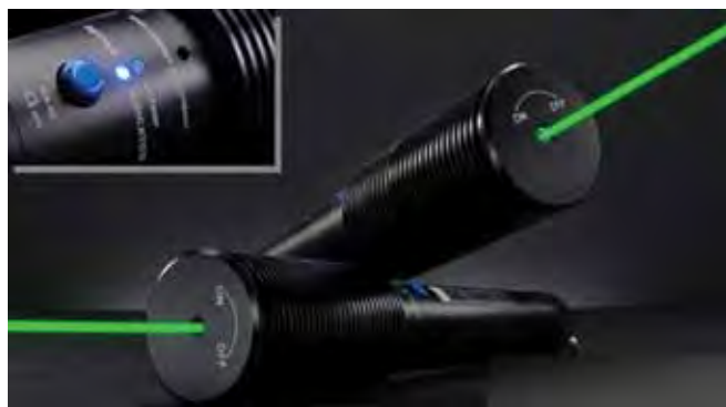
Figure 3: Example of a Powerful, Handheld Laser Device Available On-line

The latest reports indicate that aircraft illuminations by handheld lasers are primarily green (91%) in color, as opposed to red (6.3%), which was more common a few years ago. This is significant because the wavelength of most green lasers (532 nm) is close to the eye’s peak sensitivity when they are dark-adapted. A green laser may appear as much as 35 times brighter than a red laser of equal power output. Due to this heightened visibility and increased likelihood of adverse visual effects, illumination by green lasers may result in more events being reported.